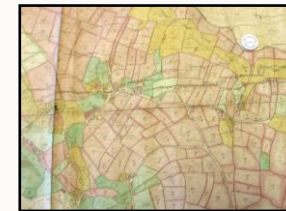
Detail from the Tithe map of Gower

Much of Gower's more recent past is well documented in Ordnance Survey maps as well as the numerous estate maps made during the 18th to 20th century. These are an important point of research in their own right and help to inform almost all types of projects.