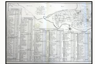
Detail from an Estate map