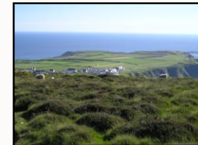
Aerial view of historic field boundaries

Many of the hedgerows of Gower have a history that stretches beyond the earliest known maps and plans of the peninsular. The land here has been managed from pre-Roman times and some of the field boundaries we see today are part of an ancient land management system.