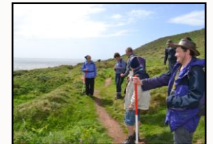
Volunteers undertaking heritage survey